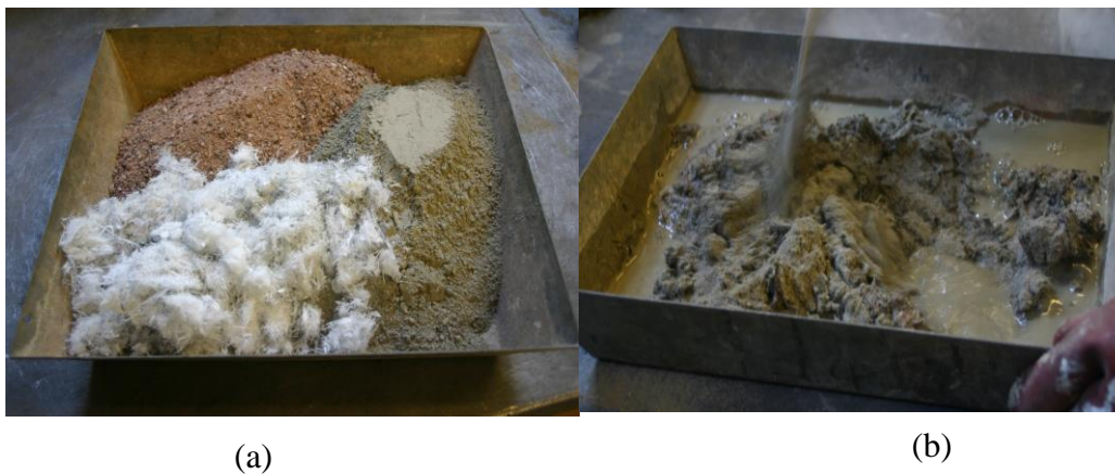
Fig. 1 (a,b). Mix proportionate (GRP waste fibre, fine aggregate and cement) in making cement composite: (a) before mixing, (b) mixing process

Casted panels were removed from the moulds and curing was done in water at 20° ±2°C. After 28 days of curing, specimens were tested to assess their suitability for use as architectural cladding panels. Fig. 1 (a, b) shows the mix proportionate (GRP waste fibre, fine aggregate and cement) in making cement composites.