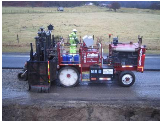
Fig. 4. Multi Head Breaker

The ultimate objective of rubblisation is to produce a structurally sound base which prevents reflective cracks. This is achieved by pulverising the existing pavement to create an assemblage of concrete segments that form a tightly keyed, interlocked, high-density material layer. It is not a typical granular material and is not an engineered material like sub-base. The machine used was a multi head breaker (Figure 4). It consists of 8 pairs of drop hammers, each weighing approximately 500 – 600kg each. They are diagonally offset in two rows, four at the front and four at the rear and capable of breaking a 4m width of carriageway in one pass. Each pair of hammers is independently lifted and controlled by a hydraulic cylinder developing between 2,700 – 16,300 Nm of energy depending on the drop height set. This can be adjusted during the works to achieve the desired fracture pattern.