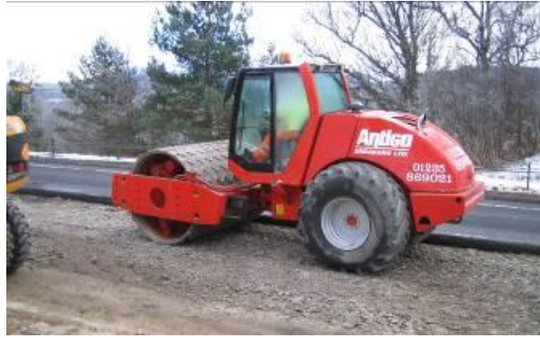
Fig. 5. Z pattern roller

Kincraig project. Replacing all of the CBM with new granular sub-base would have cost in the region of £170k. This together with removal to tip of existing material, extraction of new aggregate from quarry and transport to site would have raised costs to £270k - £300k whereas the cost for the rubblisation was approximately £120k.