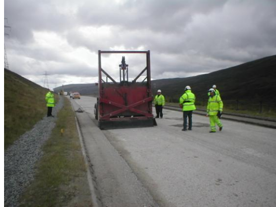
Fig. 3. Use of guillotine to induce fine vertical cracks in existing CBM

The technique first requires the CBM to be exposed by planing off the asphalt. The CBM slab is then broken into smaller lengths using specialist equipment: typically a self propelled five tonne guillotine (Figure 3). The force required by the guillotine to break the CBM with a neat single crack depends upon many factors including the CBM strength and thickness, as well as the underlying support. The drop height needs to be controlled and continually reviewed to ensure that the pavement is not being over-cracked or under-cracked. As a result of the cracking operation, the strains resulting from thermal movements are reduced and distributed more evenly. It is extremely important that the cracks created are fine, transverse and vertical to maintain good load transfer between CBM sections. The technique tackles the root cause of reflection cracking: that is, the thermal movements at individual cracks are much smaller and the occurrence of transverse reflection cracks in a new asphalt overlay are minimised. After the cracking treatment, the CBM surface is rolled with a minimum of six passes of a 20 tonne Pneumatic Tyred Roller (PTR). This seating operation is carried out to assist the full-depth propagation of induced cracks and to minimise the rocking of concrete at the location of any voids that may be present under the CBM prior to overlaying with a minimum of 150mm of asphalt.